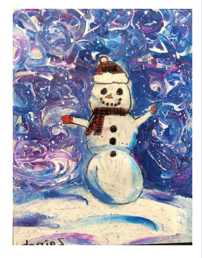
"Sun Stone Art"