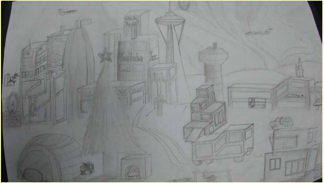
Kirby L. Div.1, Gr. 6